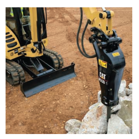
Auxiliary Lines and Connectors. The auxiliary lines and connectors are fitted as standard, meaning the Cat 302.5C comes ready to work, enabling both hammer (one-way) and auger (two-way) tool operation.