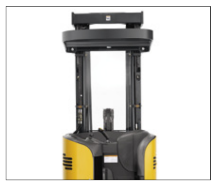
'Superclear' view mast