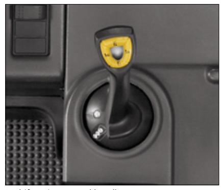
Multifunction control handle