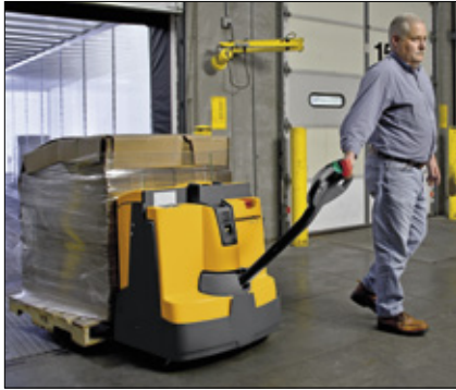
Powerful due to innovative 3-phase technology