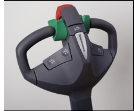
Ergonomic handle head