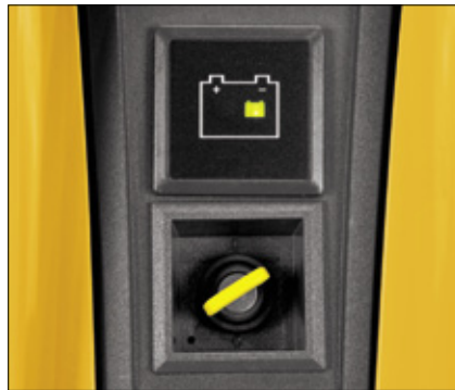
Standard key lock and discharge indicator display