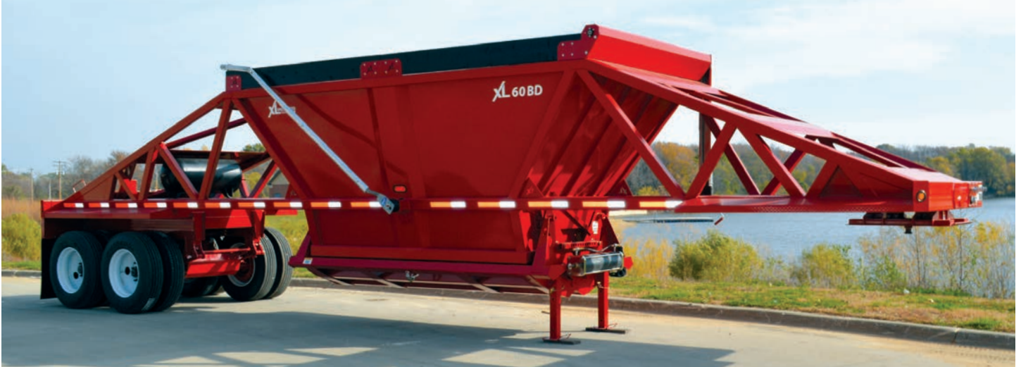
XL 60 Bottom Dump