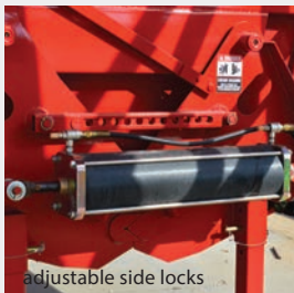
adjustable side locks