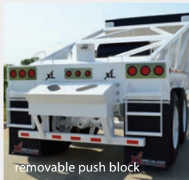
removable push block

With a 96" x 193" opening, the XL Bottom Dump offers the largest hopper opening you will find. Adjustable side locks and windrow deflectors assist in dumping various materials. The oscillating 5th wheel plate pivots as needed to pull the trailer over large piles.