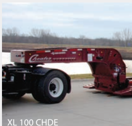
XL 100 CHDE

XL hydraulic necks are wider and stronger than the industry standard, offering increased stability for high center of gravity loads. The hydraulic support arm contacts truck frame rails only; there is no need to carry a 4 x 4 for blocking the neck.