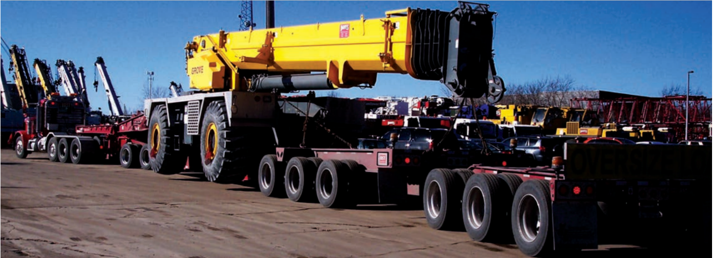
XL 150 Hydraulic Detachable Gooseneck 3+3+3 beam deck