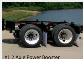
XL 2 Axle Power Booster