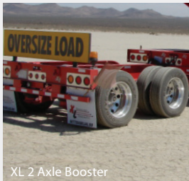
XL 2 Axle Booster