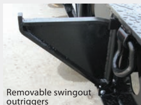
Removable swingout outriggers