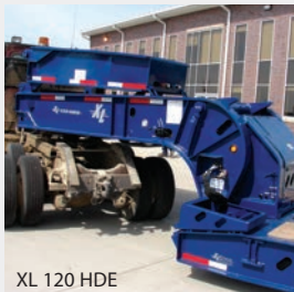
XL 120 HDE

7 position variable ride height makes hooking up to the truck easy. The different axle configurations , main deck widths, lengths and heights along with the ability to add a booster , provide superior versatility.