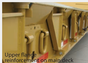
Upper flange reinforcement on main deck