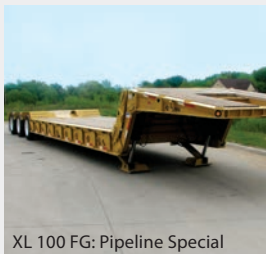
XL 100 FFG: Pipeline Special

The XL Hydraulic Folding Gooseneck handles your heaviest hauling challenges. The low incline ramp makes it easy and safe to load and transport pavers, scrapers and other heavy equipment. The neck adjusts to uneven terrain without the use of blocks so you can load and unload almost anywhere.