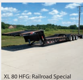
XL 80 HFG: Railroad Special

The XL HFG: Pipeline Special is engineered to handle demanding off road applications. It features a heavy-duty cross members, heavy-duty outriggers and top flange reinforcement.