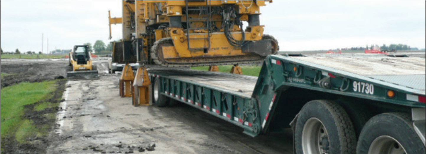
XL 110 Hydraulic Folding Gooseneck