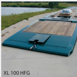
XL 100 HFG