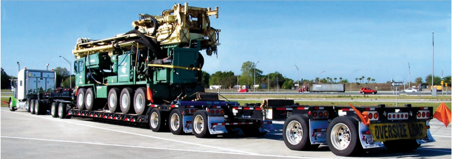
XL 120 HDG featuring XL 42 Booster (2 Axle)