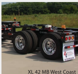
XL 42 MB West Coast

XL's East Coast Booster meets East Coast regulations with its custom-engineered lightweight design and lower wheel area deck height . It is available with axles through the web for even lower deck heights.