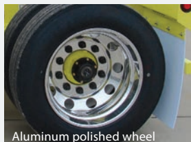
Aluminum polished wheel