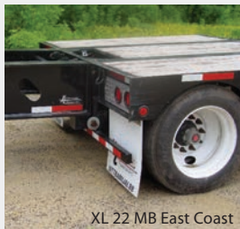
XL 22 MB East Coast

Adding an XL Booster to your trailer set-up makes your trailer suited for even more diverse loads . The extra axles on the back of the trailer distribute the weight of the load evenly. Yet, can be removed when not needed.