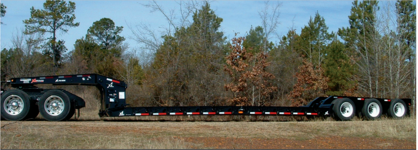
XL 110 Low-Profile Hydraulic Detachable Gooseneck: 18" Deck Height