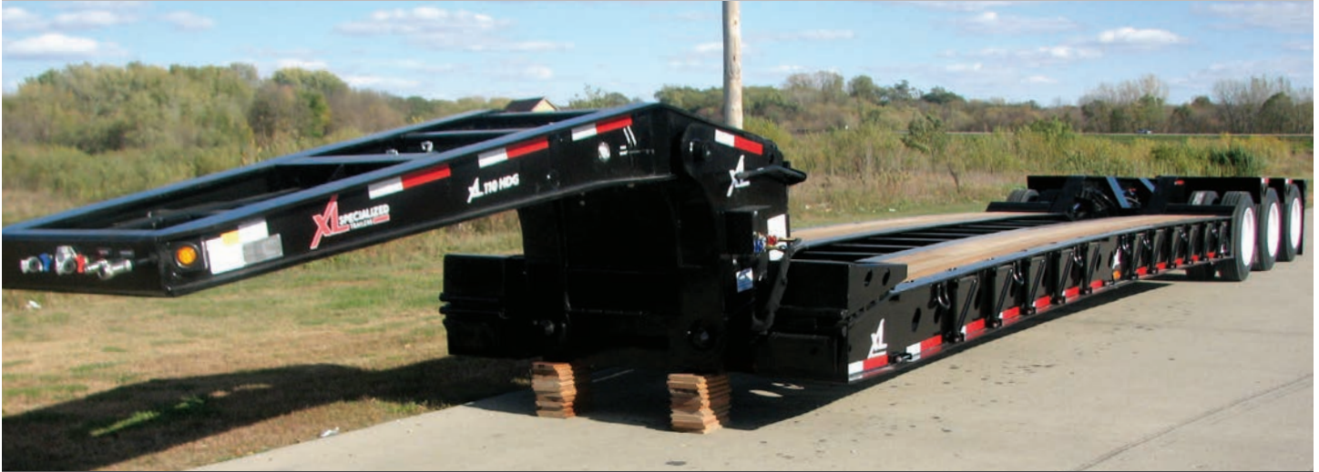
XL 110 Low-Profile Hydraulic Detachable Gooseneck