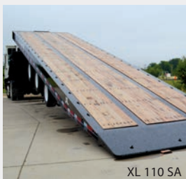
XL 110 SA

The XL Slider features an extended dump angle of 17 degrees and improved hydraulics to keep your equipment from unnecessary wear. Hydraulic sliding axle assembly with traveling bumper provides under ride protection.