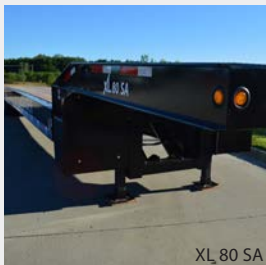
XL 80 SA