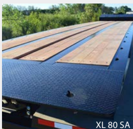
XL 80 SA

A 6½ degree load angle permits you to easily load pavers and rollers, while the winch at the front loads inoperable equipment. A single 2 stage cylinder provides maximum travel and minimal maintenance.