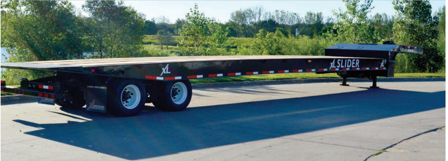
XL 80 Slide Axle (Slider)