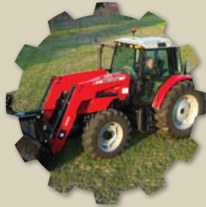
MF 900 Series Loaders www.masseyferguson.com