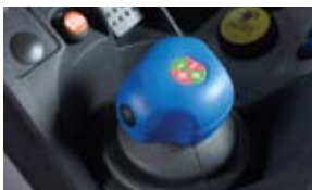
Standard Remote Management System (RMS) joystick.

A "float position" also allows the operator to release pressure on the lift arms, enabling the attachment to follow the ground surface.