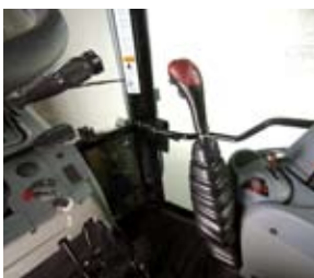
Multi-function joystick option with mechanical valves.