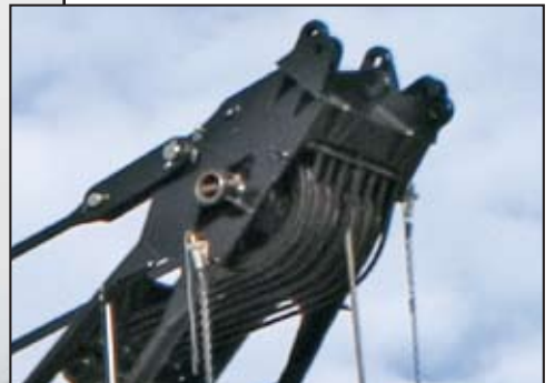
Long range tip