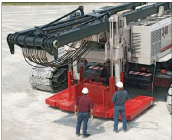
Counterweight removal mechanism self-removes for even lower main load transport weight where required.