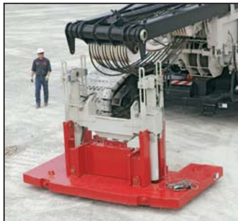
Counterweight removal mechanism detached