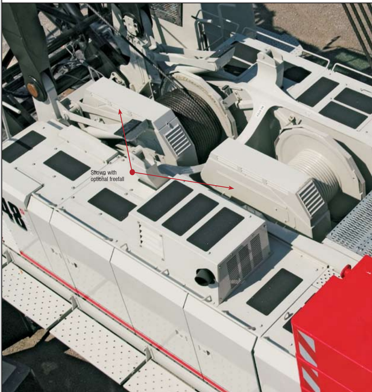
Shown with optional freefall