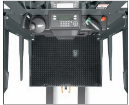
Ergonomic operator compartment