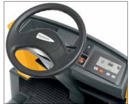
Clear layout of controls provides easy operation of the tow tractor

Built in compliance with ITSDF B56.9 design specifications* for Type E industrial trucks with Type EO battery.