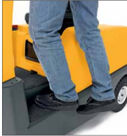
Ergonomic low step for effortless entry and exit to and from the vehicle