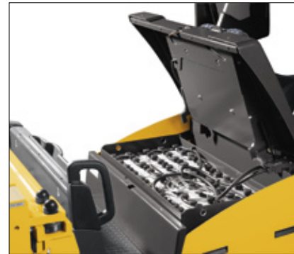
Hinged battery cover