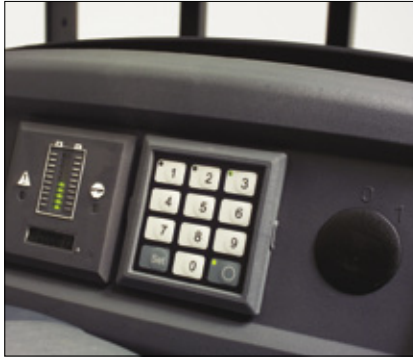
CanDis and CanCode