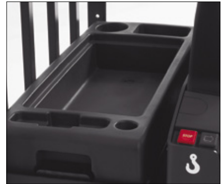
Storage tray and "ProPick" options