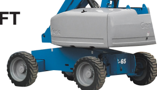
TELESCOPIC BOOM LIFT