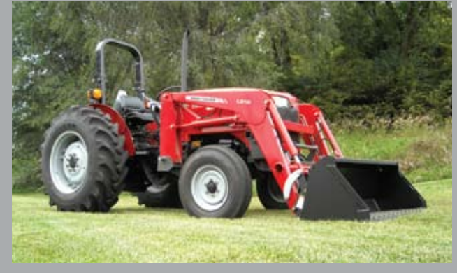
All 2600 Series models can be equipped with a front loader to improve performance on the job site. Several models are available, from economical to deluxe, to meet the job's requirements.