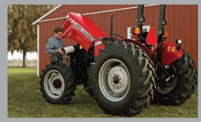
Most daily service items, such as engine oil check, can be done without opening the hood. For other maintenance, the gas assisted, single-piece steel hood opens widely for easy access.