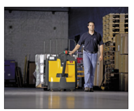
Ideal for transportation of heavy goods