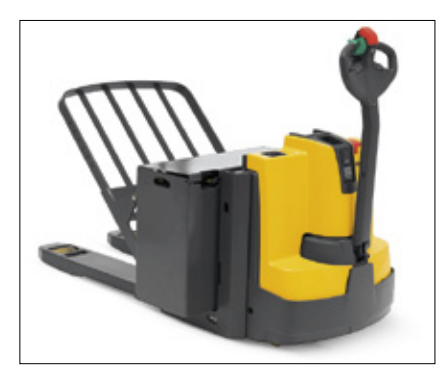
Side battery extraction on EJE 225 E.