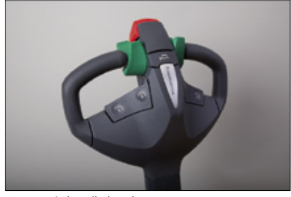
Ergonomic handle head

The handle head protects against potential failure due to its contactor-less sensor system and IP65-rated dust and moisture protection.